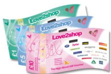
Love2shop High Street Vouchers

If your child takes part in any stage of the Well mi study, he/she will be given a £15 'thank you' token. Your child will be able to choose from High Street Vouchers or iTunes© vouchers each time.