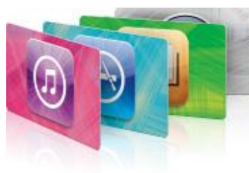
iTunes© gift vouchers