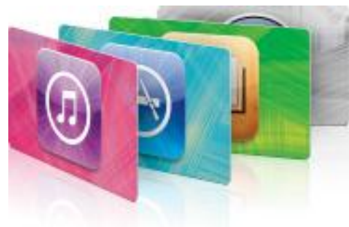
iTunes® gift vouchers