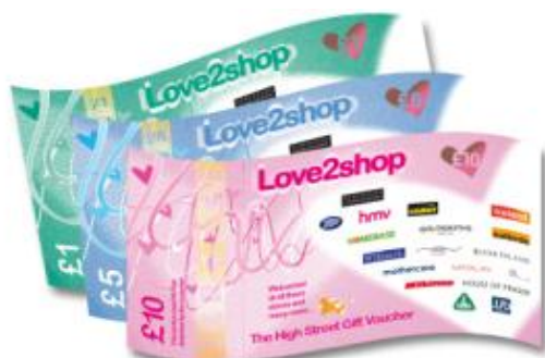
Love2shop High Street Vouchers